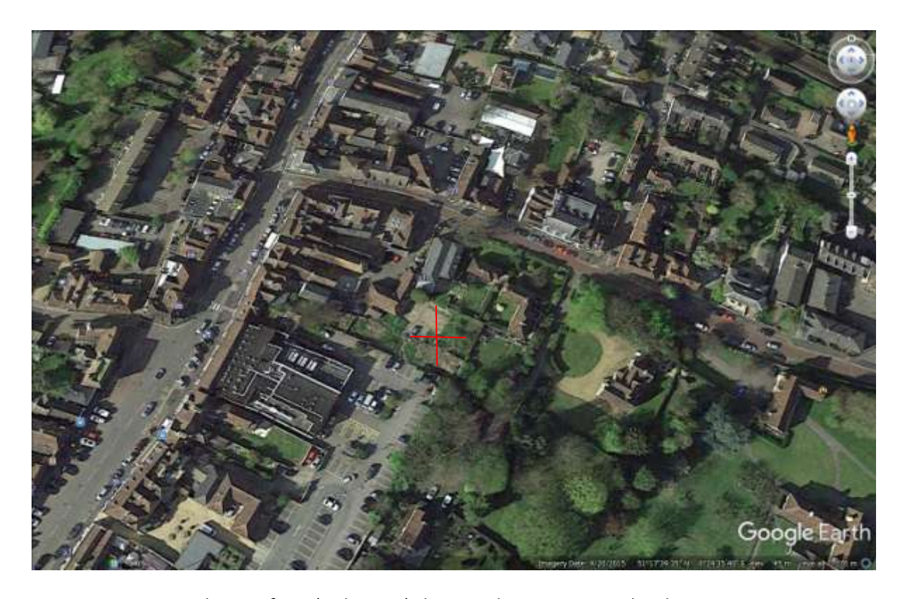
Aerial view of site (red target) showing the site prior to development.

(Google Earth 20/04/2016: Eye altitude 270m).